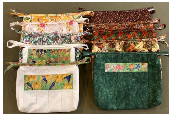
June Tote Bag & Cosmetic Bag Donations