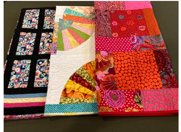
June Quilt Donations